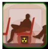
Radiological Exposure Device (RED)