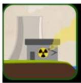
Nuclear Power Plant Accidents