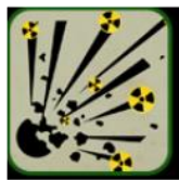
Dirty Bomb or Radiological Dispersal Device (RDD)