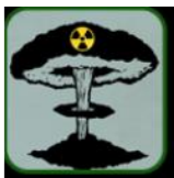
Improvised Nuclear Device (IND)