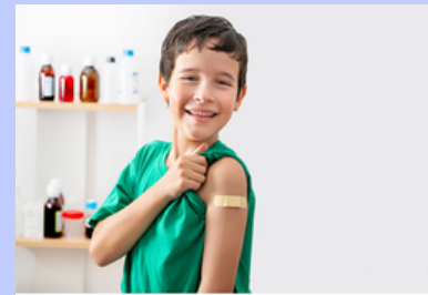
AAP's historic victory in vaccine lawsuit a 'critical step' in restoring science to federal policy

For a list of organizations supporting AAP's schedule, please click below: